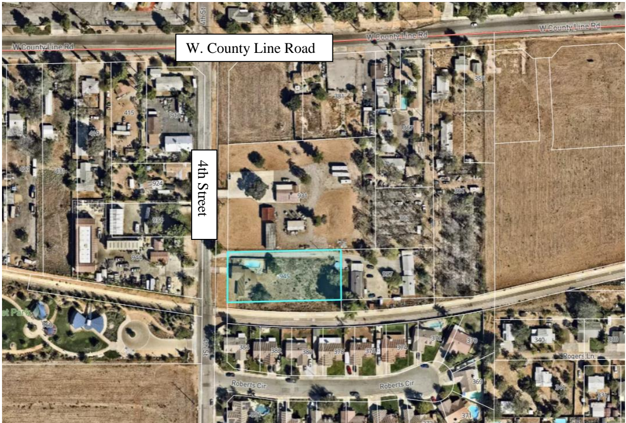
Figure 1. Project Site (outlined in blue)